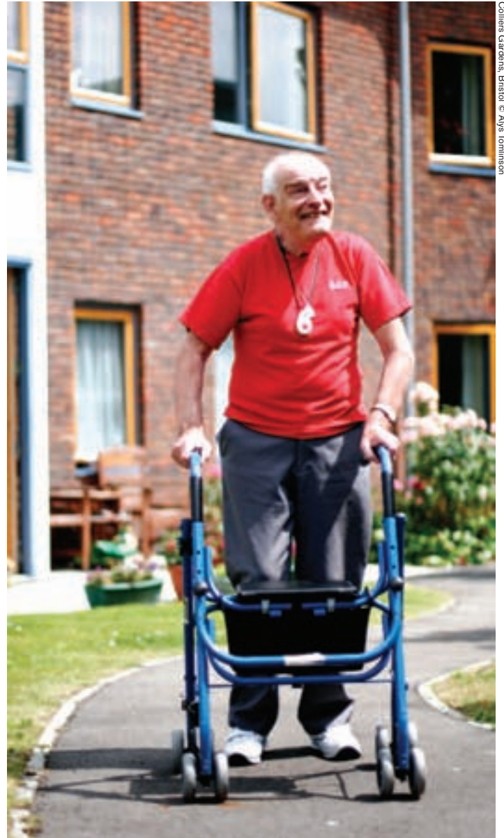
Colliers Gardens, Bristol

Brunelcare is hoping to secure a site for a scheme which will combine sheltered housing and a nursing home in one place, enabling residents to make an easy move to a place providing a higher level of care