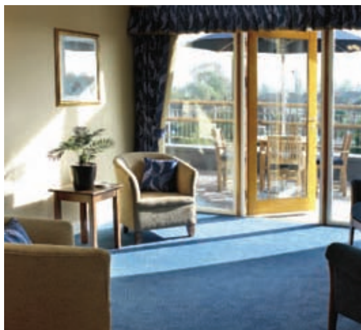
Barton Mews, Staffordshire

There is a nice sense of connection via the public footpath through the garden towards the churchyard and village centre, but it seems unlikely that this could be used by residents with walking frames or even scooters