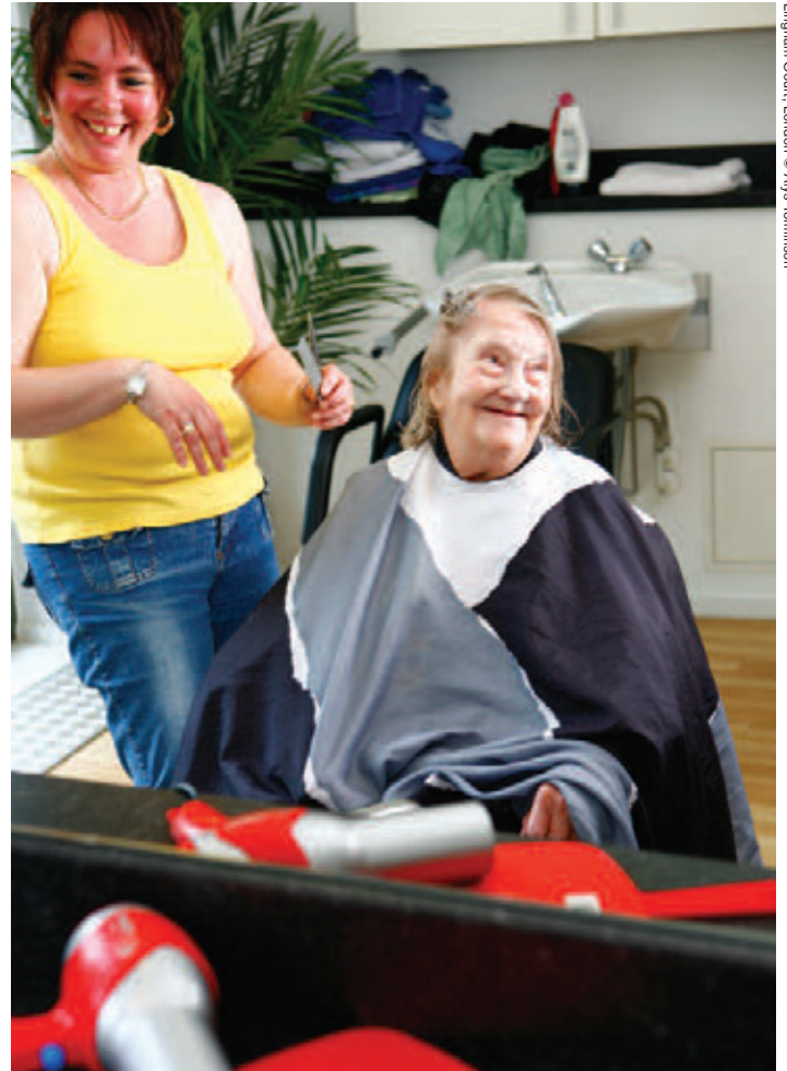
Lingham Court, London

Current financial pressures will continue to cause difficulties in raising capital and selling homes, so future-proofing housing for people to access care and grow older in one place will become even more attractive as an option. This will place increased importance on planning, procuring and commissioning housing-related services for older people and those with a disability in a holistic way.