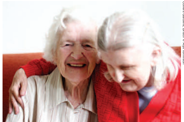
Colliers Gardens, Bristol © Alys Tomlinson

As this report was being finalised, the government had brought together a panel of leading experts, including CABI, under the auspices of the Homes and Communities Agency, to form the Housing our Ageing Population Panel for Innovation (HAPPI). The panel, chaired by Lord Best, will gather good practice from across Europe on design and delivery issues relating to housing and neighbourhood design for older people, including homes for rent, sale and shared equity. The panel was due to report back in late 2009 to ensure that future housing will create sustainable inclusive homes and neighbourhoods which our ageing population want and can afford to live in. For more details, visit tinyurl.com/nemhzhf .