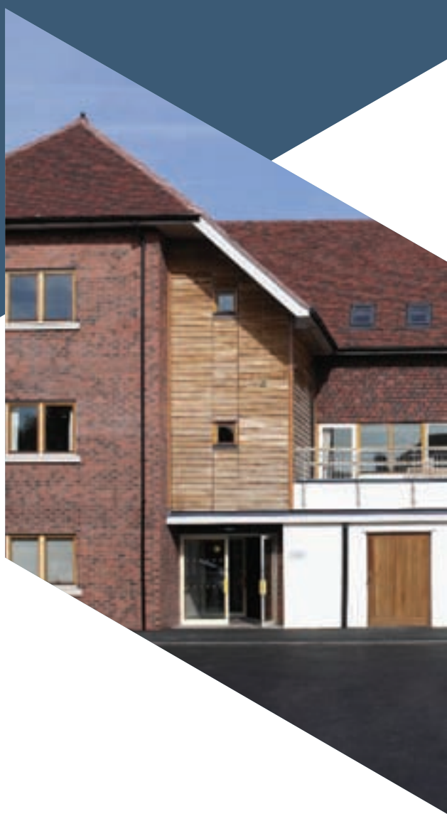
Barton Mews, Staffordshire

The residential entrance is curiously understated, almost hidden away. It opens into a small ground floor lobby, stairwell and lift which take you straight up to a bright first-floor corridor, opening onto a large residents' balcony along the front of the building. The main dining room is at the end of this, and the apartments open off both sides of the corridors which extend around the four arms of the building.