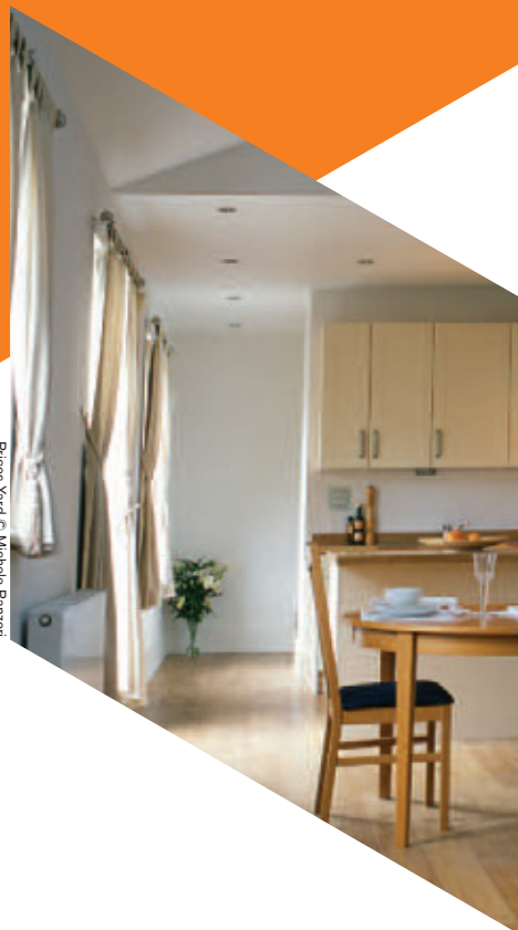
Prices Yard

However, even if the buildings themselves are accessible, the inaccessibility of the surrounding area can negate these achievements.