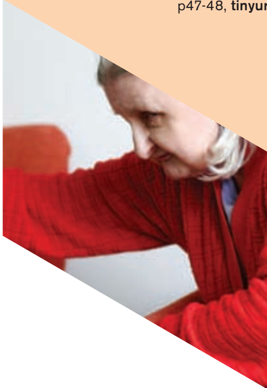
Colliers Gardens, Bristol