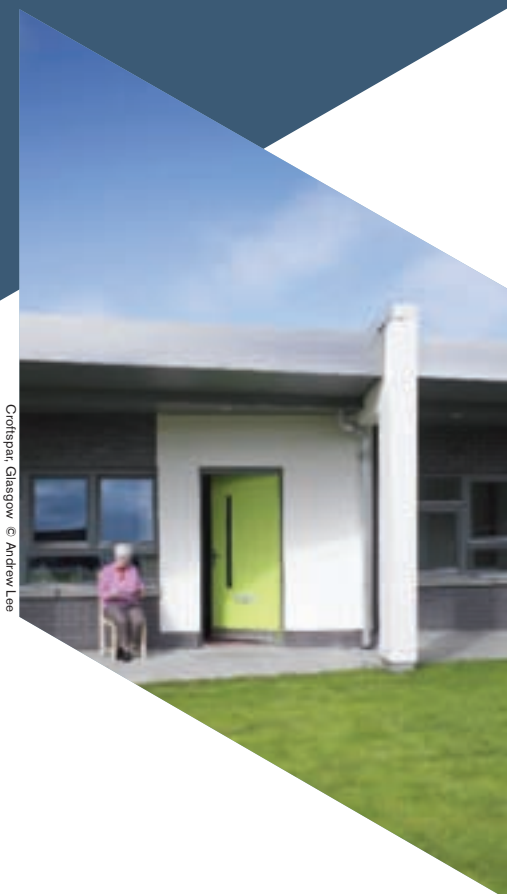
Croftspar, Glasgow

The site is in a run-down residential area. There was considerable opposition to the project, due both to the loss of open space, and rumours about the nature of the development. Partly for these reasons, the scheme was designed to be low-rise, small in scale and modest in its visual and physical impact. The planners insisted the building height should be reduced as much as possible. The scheme is surrounded by other housing but is set back from the road and an area of land has been retained as open space.