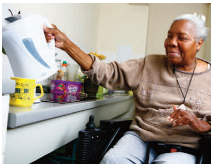
Lingham Court, London