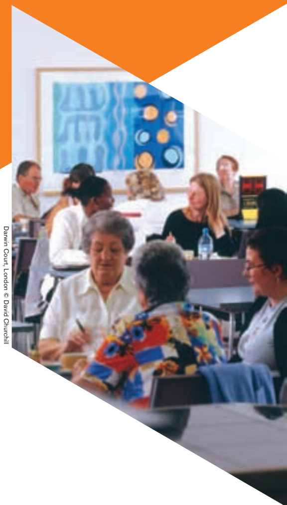
Darwin Court, London

The building has a bright and open public face, which welcomes visitors without compromising the privacy of tenants, underlying the development's close integration with the surrounding community. In the absence of a local pool, the swimming pool is regularly used by schoolchildren during the day. The café is used by various organisations, and the staff members say it is a great place to work in, as well as to live in.