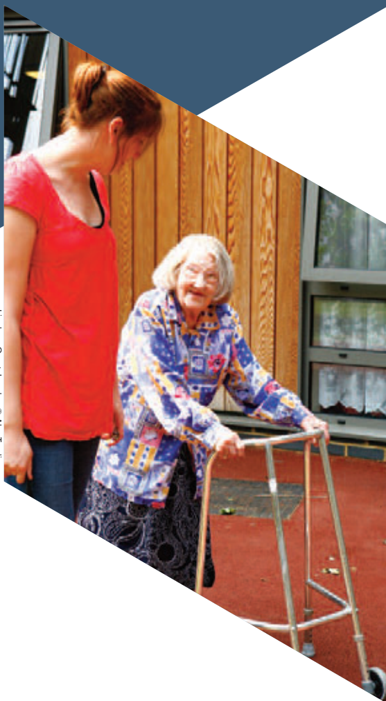
Lingham Court, London

The 30 affordable housing flats for older people, designed by Pollard Thomas Edwards Architects, are owned and managed by public sector provider Metropolitan Housing Partnership. The scheme also includes 40 flats for outright sale. The total cost was £10 million and the outright sale flats subsidised the affordable housing.