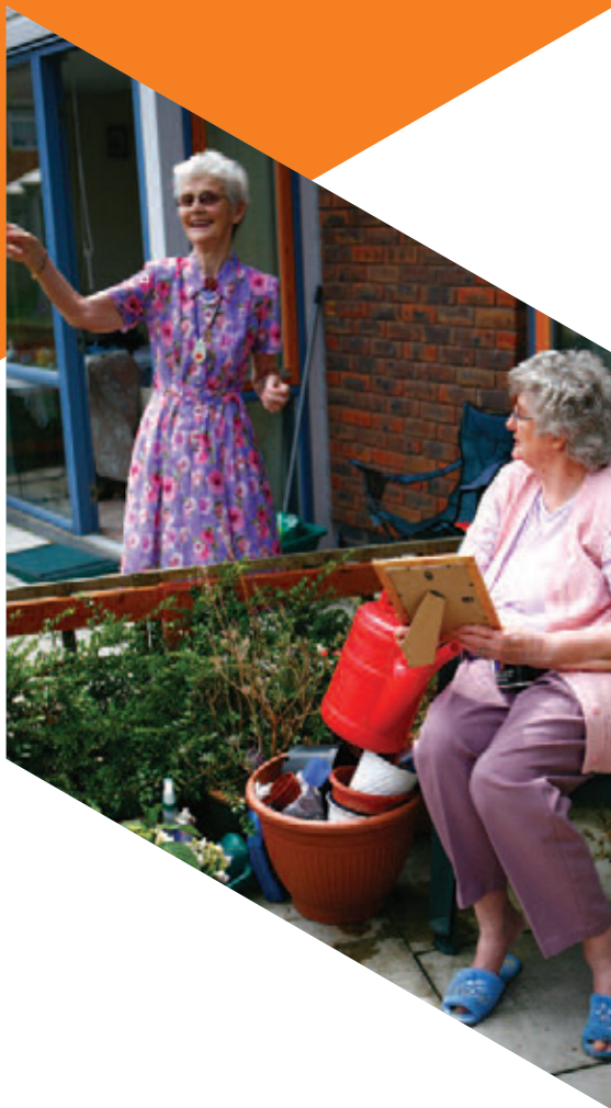
Colliers Gardens, Bristol

The 50 flats for older people, owned and managed by public sector provider Brunelcare, won a RIBA award for architects Penoyre and Prasad. The £7 million building costs were funded by the Housing Corporation and the scheme was completed in 2006.