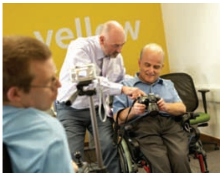
Foundations for Living, Huntingdon