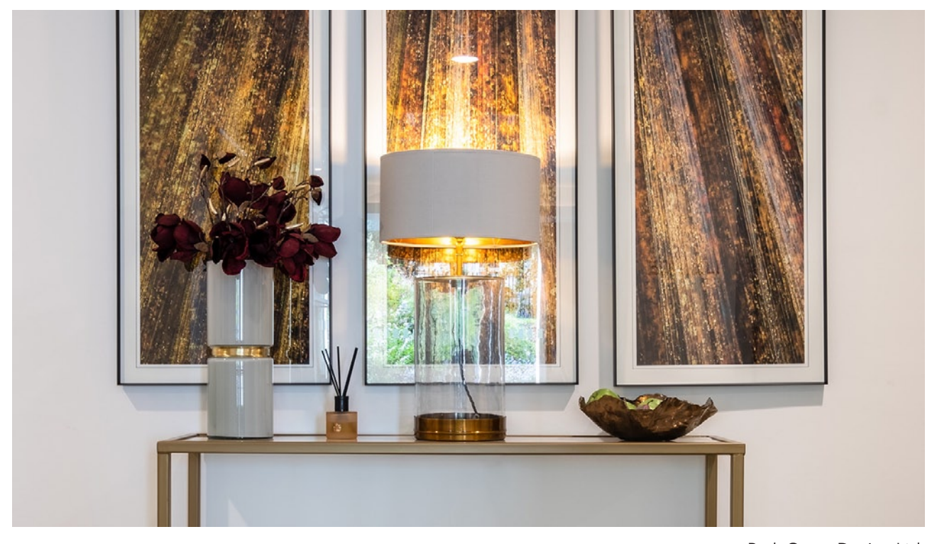
Park Grove Design Ltd.