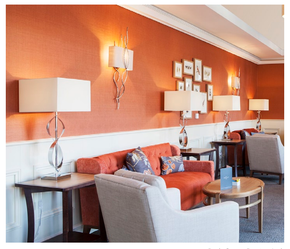
Park Grove Design Ltd.

Minimise or eliminate pattern on walls if dementia is indicated. When tiling in these areas use grout the same colour as the tiles to prevent creation of a grid pattern or lines.