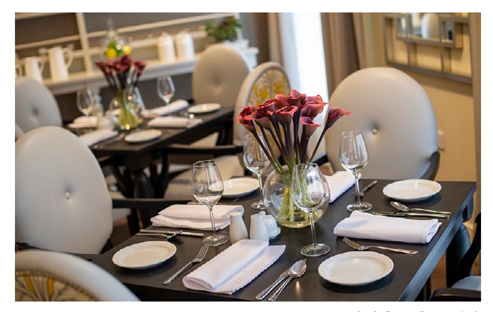
Park Grove Design Ltd.

Furniture finishes provide an opportunity for contrasts to floor and wall colours. Metals, plastics, and painted finishes can be used to add interest, but natural finishes provide for a more homely environment.