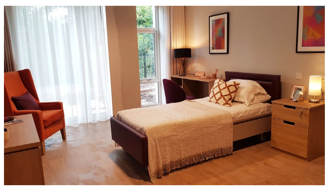
Park Grove Design Ltd.