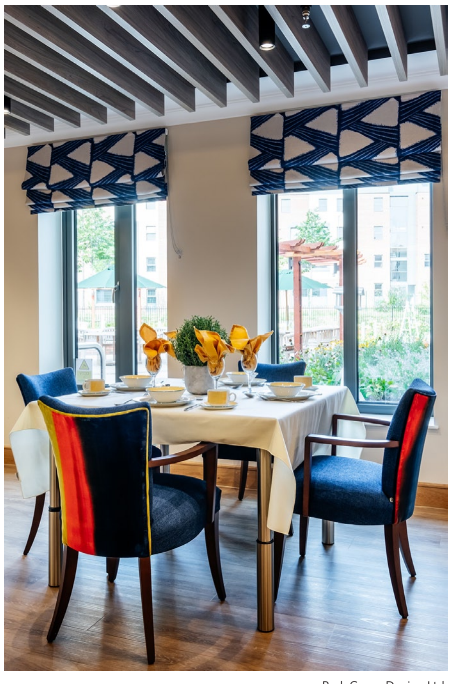
Park Grove Design Ltd.

Dining areas can be particularly noisy and additional measures might be considered in these spaces such as soft acoustic wall or ceiling panels, or acoustic ceiling slats.