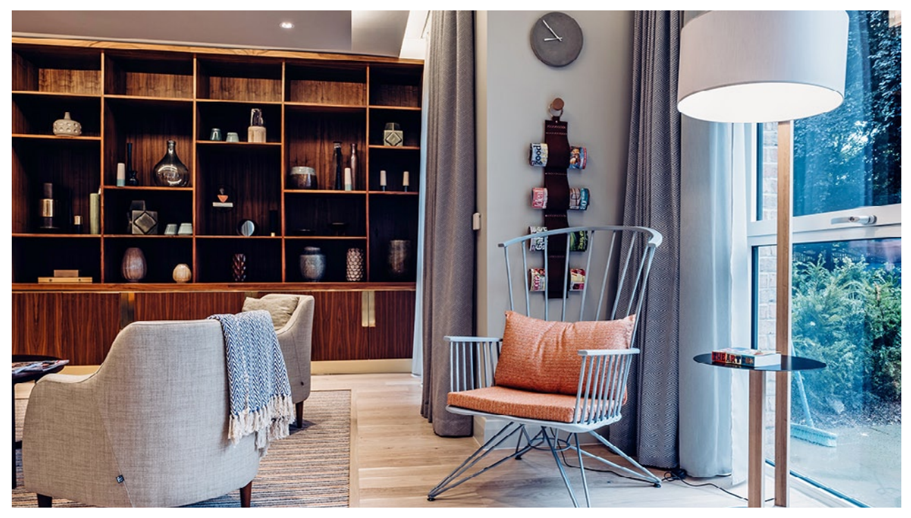
Park Grove Design Ltd.

Furniture groupings are most homely if they appear to have evolved, rather than being purchased at any one time. You are providing a home for residents, not a hotel. The occasional quirky, humorous piece is encouraged as are a variety of shapes. As previously noted, furniture must not have sharp corners or edges.