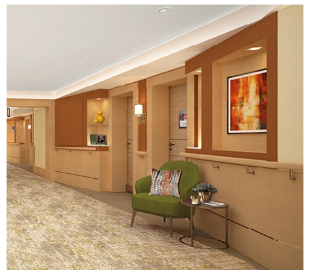
Park Grove Design Ltd.

While cliché, it is also factual to say that people come in all shapes and sizes. It's therefore essential that table and seating heights should vary in communal areas to allow everyone to inhabit the space in comfort. In corridors, and only where it will not interfere with emergency escape routes, allow for rest seating. Staircases with landings should also have this provision. If space does not allow for chairs, consider using a narrow bench with raised side arms.