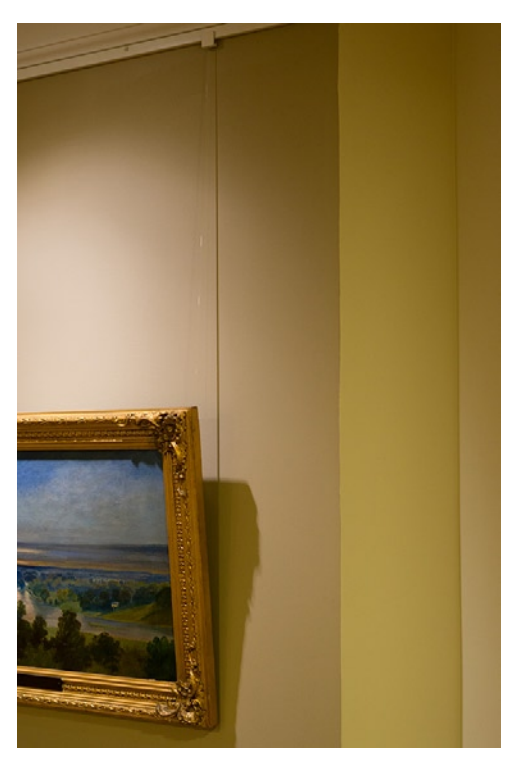
Park Grove Design Ltd.

Where dementia is indicated, avoid the use of images with images with pointy or sharp looking patterns, as well as those which could be interpreted as having eyes. Breakable accessories should also be edited from these areas and Perspex® rather than glass, is recommended in picture framing.