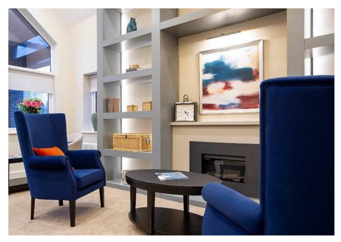
Park Grove Design Ltd.

Lounges need the variety of seating referred to in the Furniture section of this Factsheet. Fireplaces and simple display shelving make good focal points. Fire surrounds must not have sharp corners and with hearths visibly raised. Gas or electric fires are good choices and the effect of a mist unit in an electric system will provide a good effect.