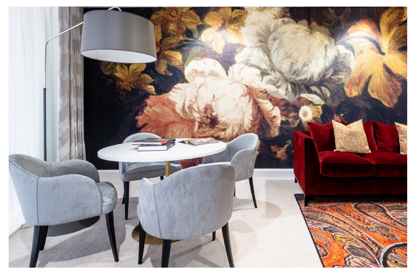
Park Grove Design Ltd.

This document shares key interior design considerations when developing environments for later living which are both inviting and in-line with current design research. It builds on the Housing LIN Factsheet No.34, first published in 2012. We hope you will find inspiration here.