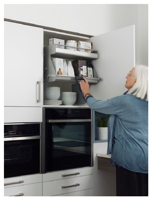
Kitchen by Symphony

Manual dexterity can be challenged as we age. Access to storage will be easier with an open handle rather than a traditional knob. Storage is also easier to reach with drop down interior shelving, now available in most kitchen ranges.