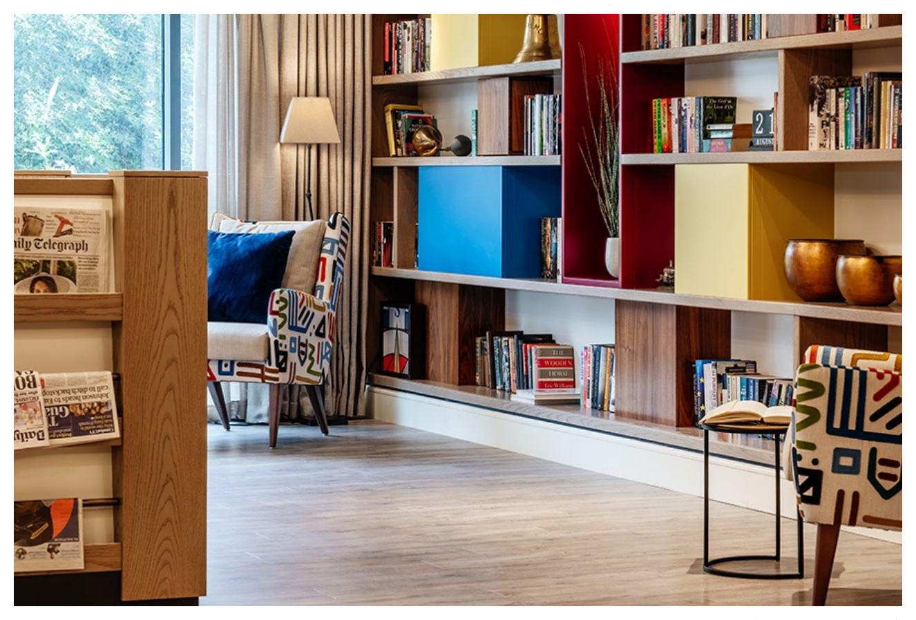
Park Grove Design Ltd.

This Factsheet is intended to be used as a discussion tool and to aid in considerations for the interior design of new build and refurbished housing schemes for older people, including concepts for: extra care housing, dementia design, and is applicable to private residential properties. It does not cover building regulations or specific design guidelines which can be found on the design pages of the Housing LIN website. This factsheet provides inspiration for making housing which meets many of the needs of older people while creating a desirable place in which to live.