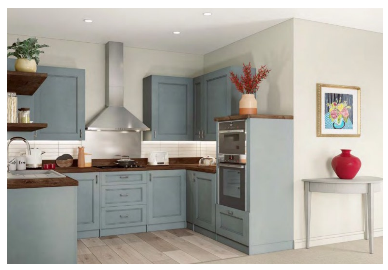
Design by Motionspot

Maintain high contrast levels between counters, units, backsplash and flooring and refer to the Contrasts and Surfaces pages of this Factsheet as needed (pages 5-7).