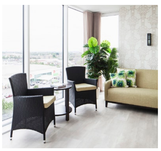
Park Grove Design Ltd.