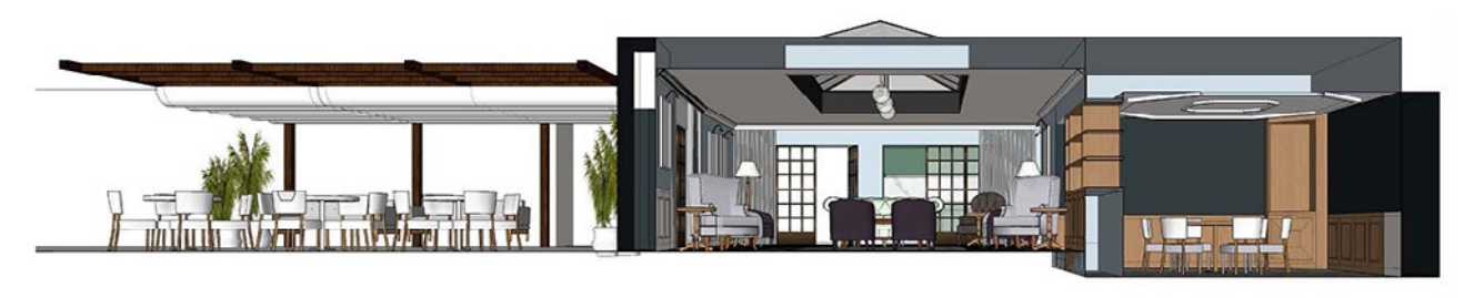
Park Grove Design Ltd.

The British Institute of Interior Design (BIID) has been working diligently to assure designers deliver long-lasting design with low waste and environmental impact and their website offers a 'Sustainable Specifying Guide'. Designs should account for product lifecycle and the environmental impact of any materials used.