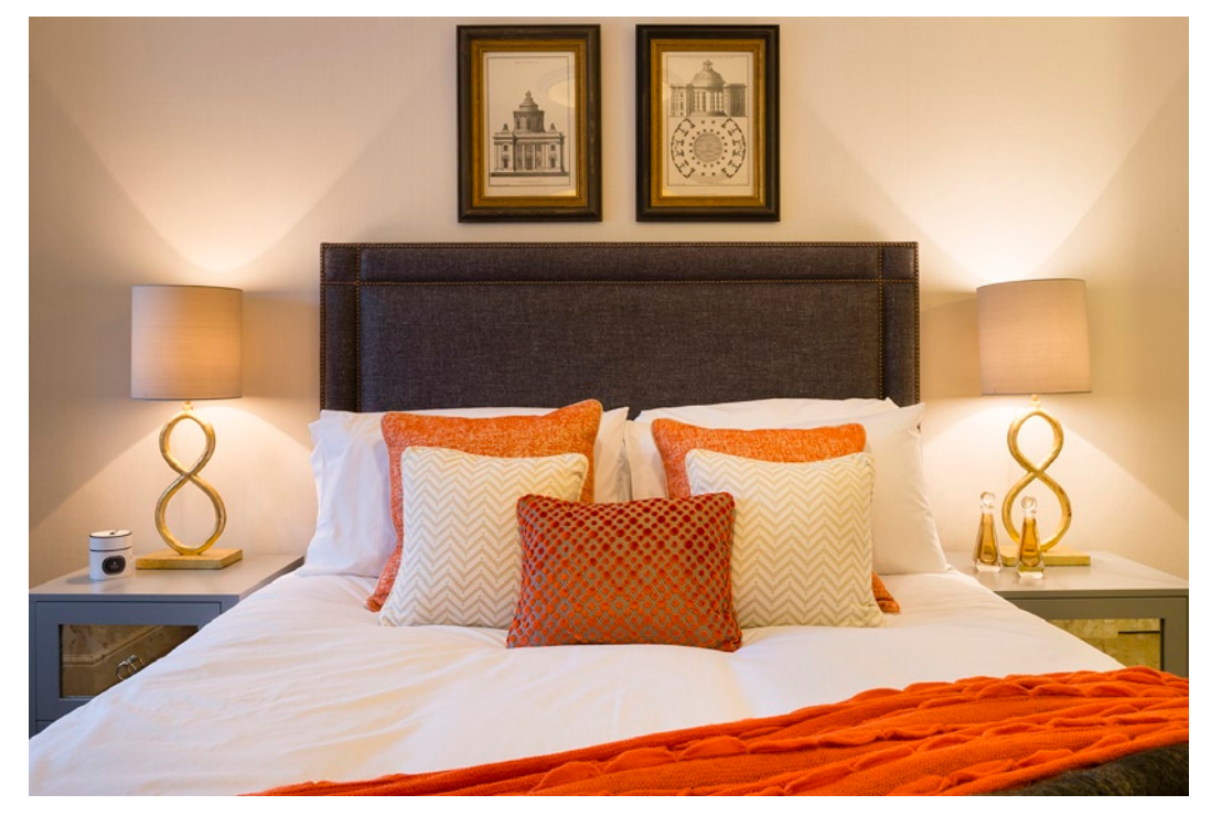
Park Grove Design Ltd.

Potential entanglement is to be avoided in bedroom designs for this population. You will therefore wish to avoid floor-length bed dressings as these can become a trip hazard at night. Likewise, there should be no loose rugs. Where a bed is dressed in decorative cushions and throws, provide a chair or surface well away from the bed where they can be stored at night. Bedside light switches should be easy to access and make sure bedside table surfaces are large to minimise trips for medications, lotions, and potions.