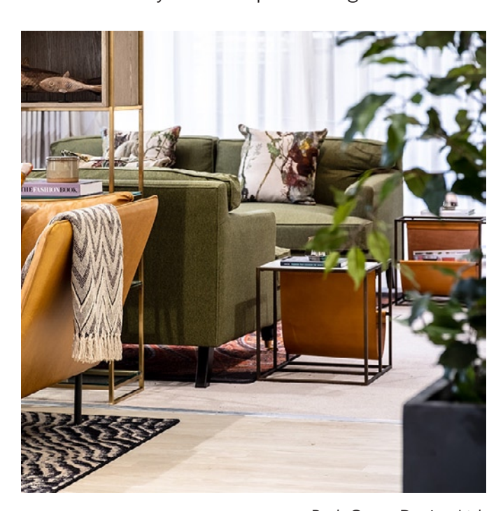
Park Grove Design Ltd.

Lounges need the variety of seating referred to in the Furniture section of this Factsheet. Fireplaces and simple display shelving make good focal points. Fire surrounds must not have sharp corners and with hearths visibly raised. Gas or electric fires are good choices and the effect of a mist unit in an electric system will provide a good effect.