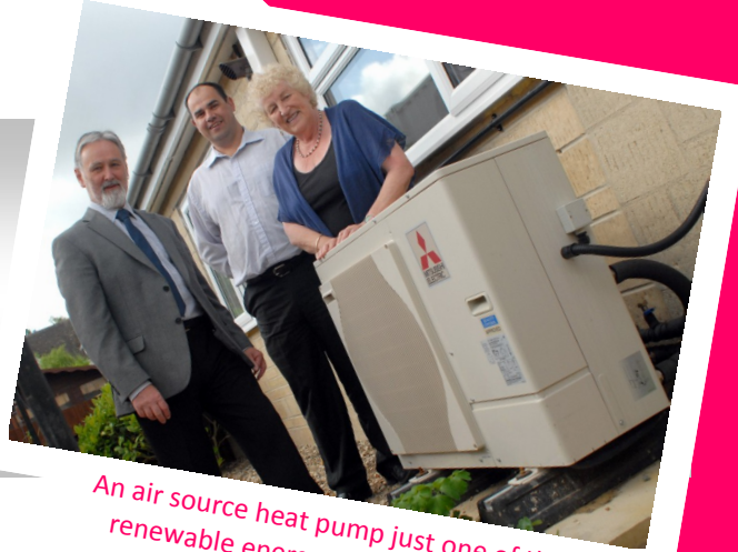
An air source heat pump just one of the renewable energy solutions used by Stroud District Council

Based on the above data and using the Social Return on Investment models, we can assume the following likely benefits of savings to the NHS: