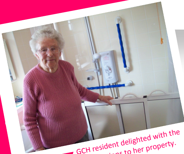
GCH resident delighted with the adaptations to her property.