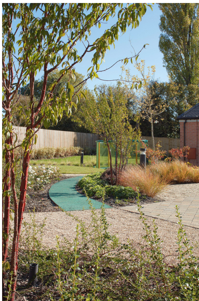
Communal gardens at St Edburg's Path, Bicester