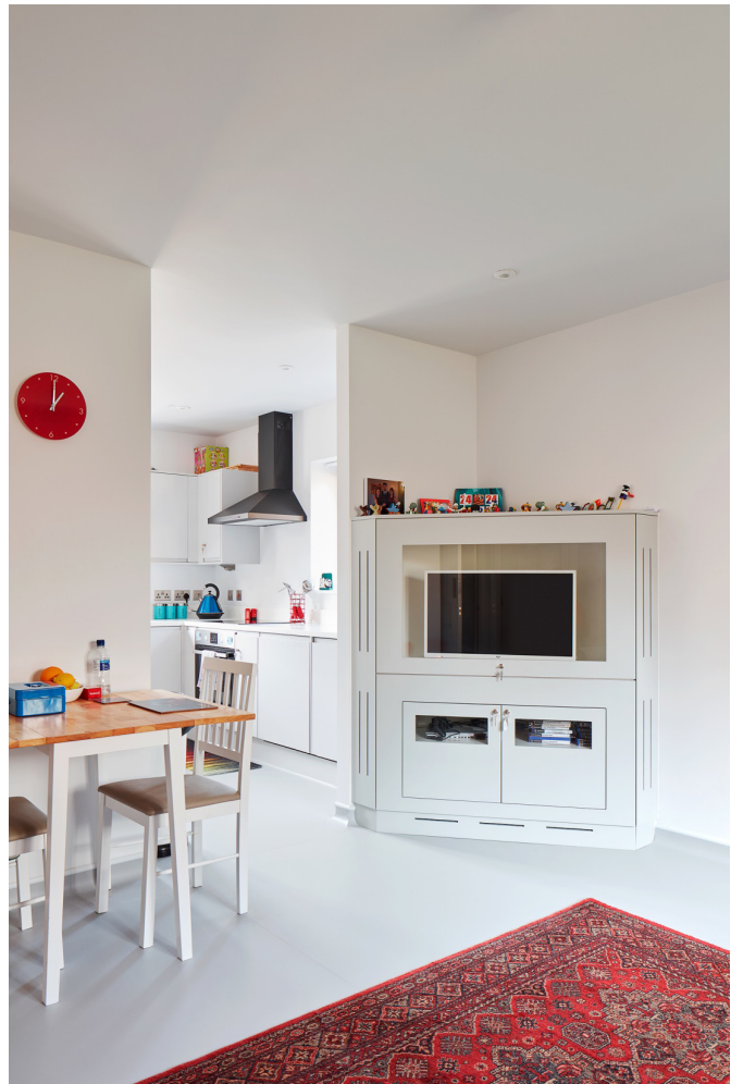
Interior design of the homes, with muted colour scheme and purpose-built furniture