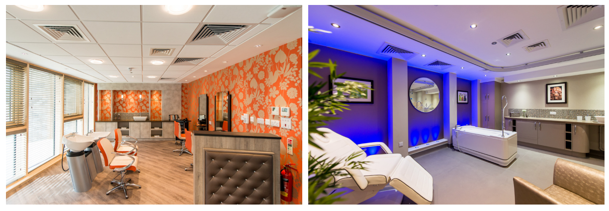
Hair & Beauty salon and Spa-Bathroom

The Community Hub of approx. 2000m<sup>2</sup> includes: