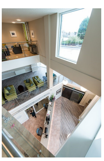
Atrium in communal space

Car parking is available on both sides of the development. The entrance is located on the East/South façade accessed from the car park. Servicing to the building for deliveries/fire etc. are located to the North-East corner away from the main entrance and public entrance. There are no apartments facing the car park at ground floor level.