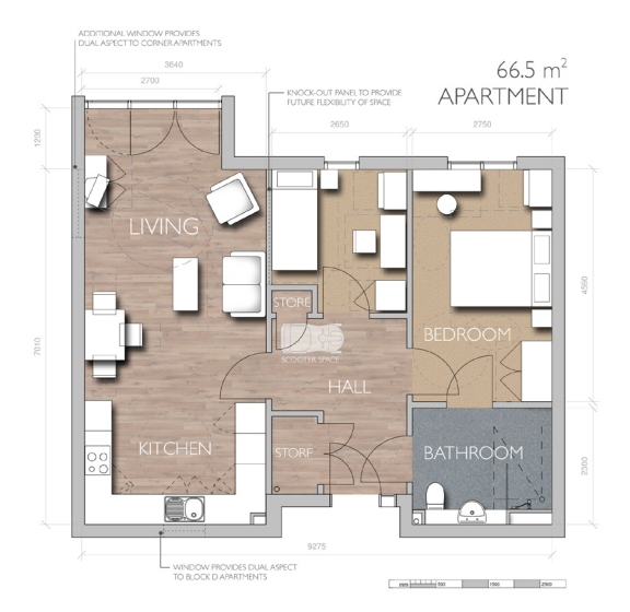
Generous Space Standards and Flexible layouts

Village 135 has been designed to meet with; Manchester City Council's Design for Access 2 guidelines (<u>https://tinyurl.com/designforaccess2</u>), Lifetime Homes and Standards and Quality in Development. Meeting with each of these standards ensures the living spaces are generous in size and are designed to meet the differing needs of the residents.