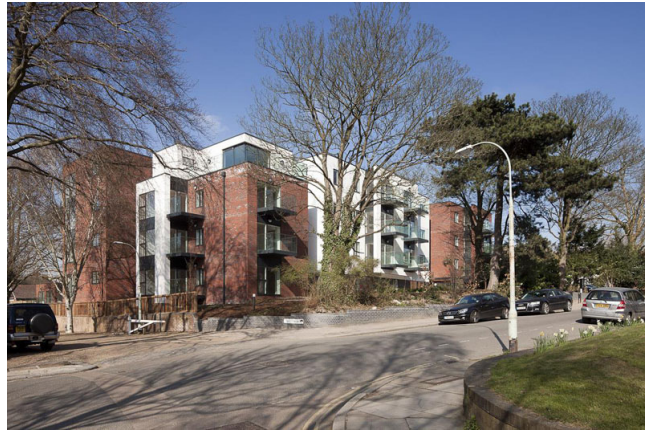
View from Broadlands Road

The view from Broadlands Road is of three distinct building elements connected with glazed links that respond sensitively to the local context and reflect the rhythm of the existing villas. This approach was not simply viewed as an urban design response but exploited to create meaningful spaces within the scheme i.e. within the glazed links. The new building broadly follows the general footprint of the previous buildings that occupied the site and is respectful to the existing mature landscape.