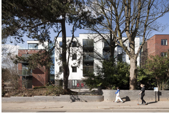
Broadlands Road Elevation

There was an identified shortage of Extra Care housing in Haringey and the scheme at 'Trees' was seen as an important part of the strategic delivery of housing for older people in the West of the Borough. The Local Authority Housing & Adult Social Care Departments played a role in the development of the brief and provided valuable support