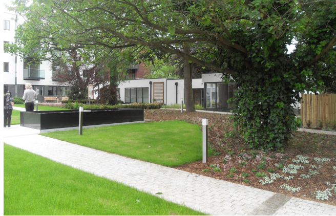
Main Communal Gardens

The interior design is informed by the architectural approach and the result is calm and contemporary. Materials selected should age gracefully over time. Room layouts are oriented to maximise the views of the landscaped gardens and furniture is simple in design but of a high standard. Each level has subtle variations in colour to passively assist orientation. The client employed PRP Interiors to achieve the aspiration for a quality product throughout the building. The appointment of the interior designer was as crucial as all the other consultants in achieving the final result and cannot be emphasised enough when procuring such buildings.