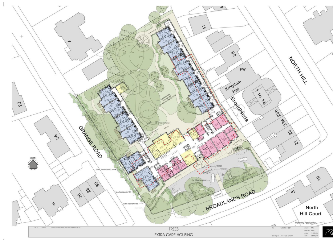
Ground Floor & Site Plan