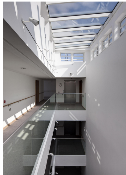
Central Atrium - Upper Floors

The design is 'permeable' containing smaller clusters of homes arranged around an internal atrium, which creates a strong connection between the ground floor communal spaces and the residential areas on the upper floors. Having apartments in smaller clusters with shared circulation areas rather than on long corridors helps to promote neighbourliness, maximizes natural daylight and assists orientation.