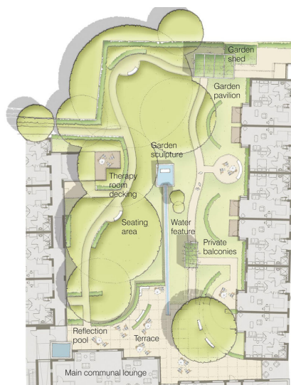
Landscape Plan - Rear Gardens

The Housing LIN has published a Factsheet on design, available at: www.housinglin.org.uk/pageFinder.cfm?cid=1629