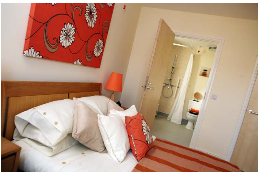
Clear visibility into bathroom from the main bedroom – Woodridge Gardens, Washington, Sunderland

Multiple cues for doors could involve for example, a toilet door being a single bright contrasting colour with a sign showing both the words and the picture. Objects or architectural features work better than colour for orientation. Certain walls could be curved, have a noticeably different texture, or a painting / clock / pot plant can be strategically positioned. Motifs on doors or at eye level on walls and noticeably different joinery can give an identity to each household and cues for residents to know where they are.