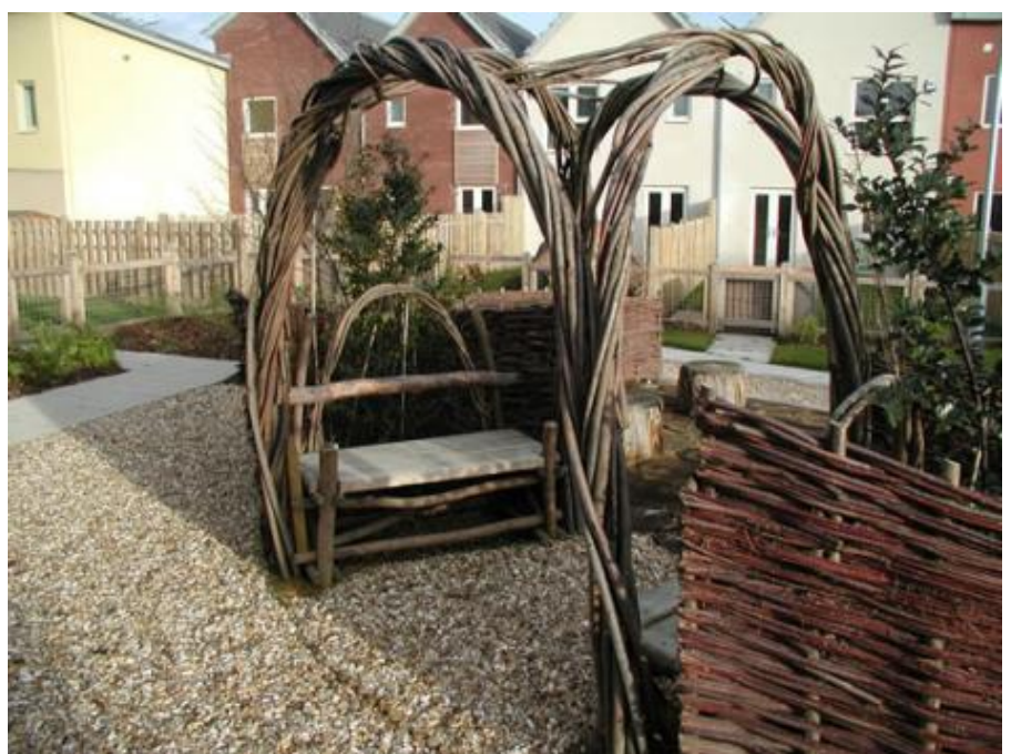
Seating areas giving private but attractive space – The Staiths at Gateshead