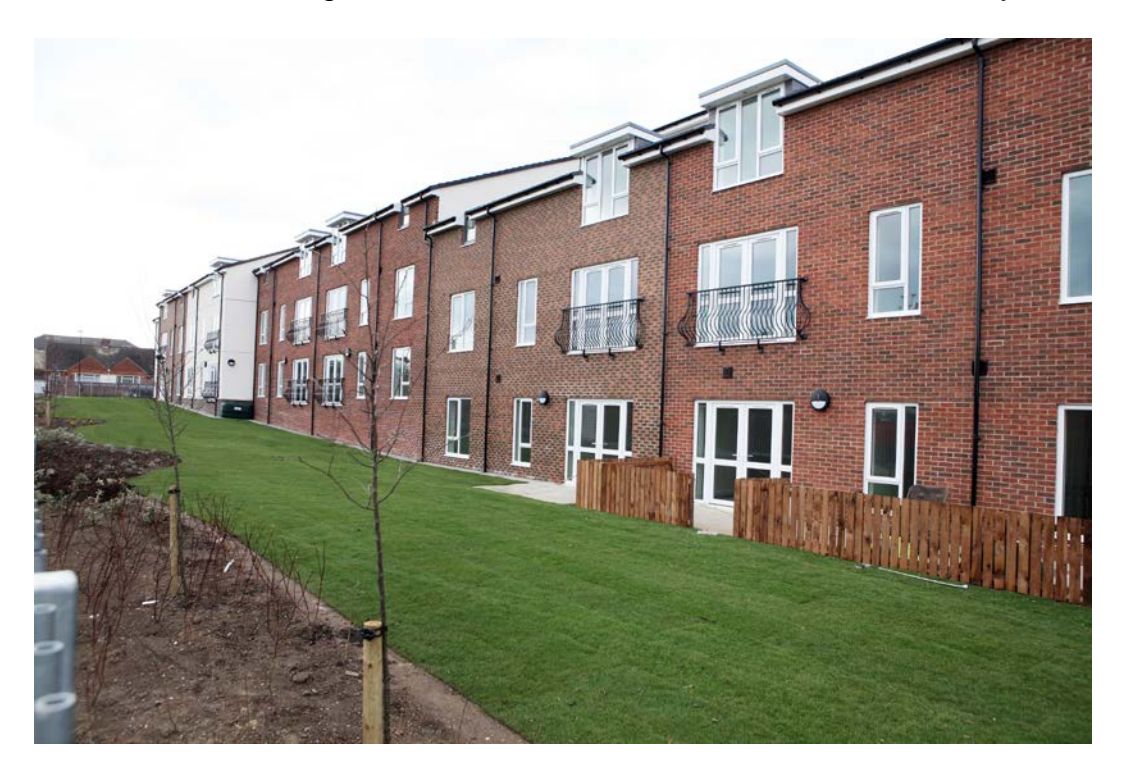
Example of gated dog run for Guide dog

Natural materials assist way finding, divide spaces, highlight level changes and help create a warm and less clinical environment. Callers can be recognised – via clear glazing beside the door, a door view, audible caller recognition or door entry system. Letter boxes should be centred within the door with a 'letter cage' on the inside and door numbers centred at eye level.