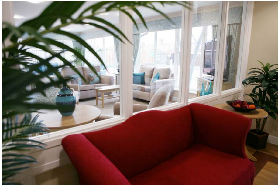
Seating area, Beckwith Mews, Silksworth

A child friendly toilet area including a baby changing area should be provided for those visiting people in the scheme; or using the communal areas who have children with them.