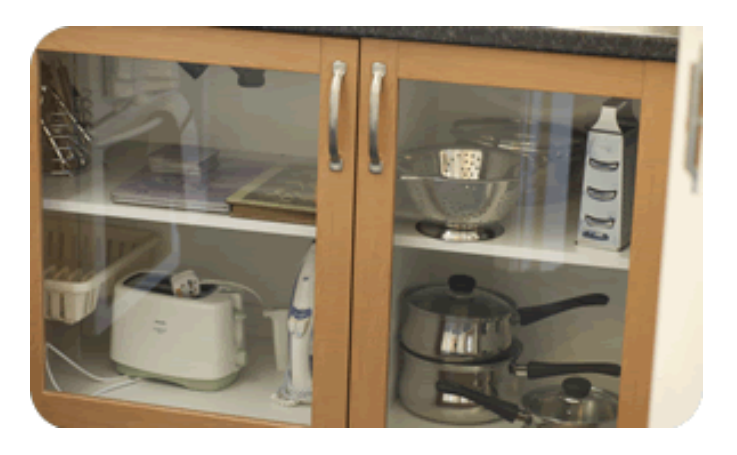
An example of clear glazed kitchen units

Eating and drinking is always important, but a person with dementia may lose their appetite and their ability to care for themselves in this way.