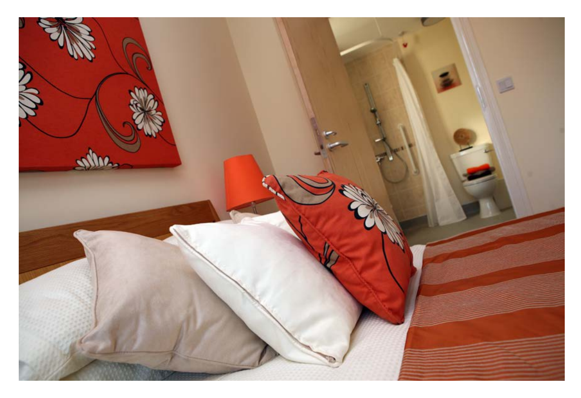
Bedroom into bathroom / walk in shower at Woodridge Gardens, Washington

A bedroom must provide for sleep and relaxation with safe movement and adequate space for storage. The bathroom should be linked directly to the bedroom to enable easy access for those with poor mobility. Windows must be easily accessible and easy to open giving consideration to people with mobility, disability and dexterity problems. Ventilation must be achieved while maintaining home security / safety.