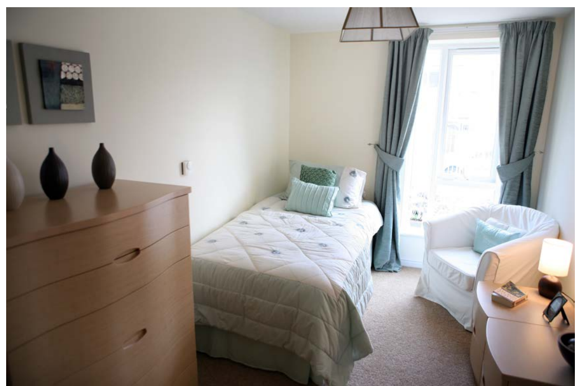
Second bedroom provision at Beckwith Mews, Silksworth

Evidence shows that a second bedroom is a high priority for residents. It can provide for couples who choose to have their own rooms, often caused due to a medical issue; provision for caring arrangements /sleepover provision; spare room for family and friends; enables older people to continue to have grandchildren sleeping over. A third habitable room in housing for older people is an HCA expectation (if the scheme is receiving grant funding from the HCA). However, one bedroom apartments must be considered to enable those people under pensionable age but over 55 to still access extra care housing but not pay for second bedroom tax.