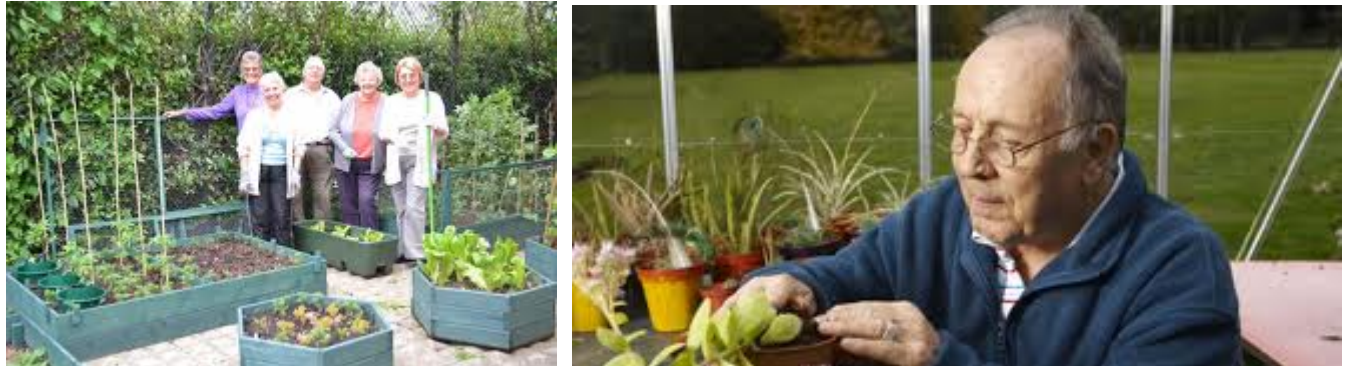
Gardening club and potting shed can provide social opportunities; personal interest; self-worth and opportunities for reminiscence.

Biodiversity should also be incorporated into the design to encourage wildlife into the garden space and maximise the potential of the plants used i.e. fruit trees; herbs for kitchen use and craft use; plants for sensory enhancement; areas to encourage fitness activities and social activities. BREEAM and Middlemarch will recommend wildlife attracting planting to support Code for Sustainable Homes. However, consideration must be given to the plants recommended in these lists omitting any poisonous; prickly and thorny planting.