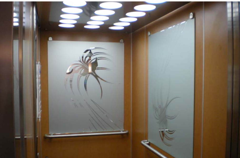
Manifestations in lift at Woodridge Gardens extra care scheme, Washington

Normally two lifts are provided in case of breakdown with one wheelchair lift whilst the other needs to be a stretcher lift. Emergency call buttons must be available near the ground floor of the lift to enable someone to push this if they fall in the lift and are unable to reach the emergency call panel which is usually provided on the wall of the lift.