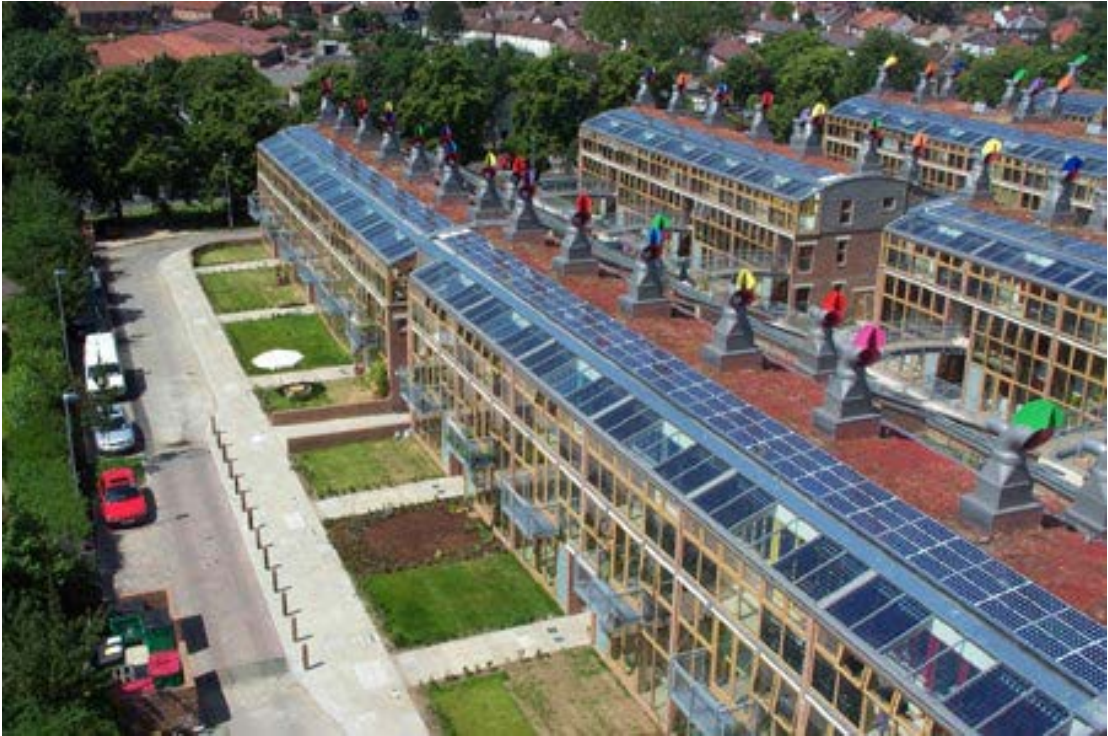
Example of sustainable design - BedZed and Peabody Trust

We expect to see both sustainability and energy conservation embraced within design for new buildings, in particular, the use of natural light, recycling of rain water, high levels of heat conservation, solar panels, heat pumps, ground and air source, and biomass heating along with renewable electricity supply where practicable. In turn we anticipate lower costs for residents in terms of heating charges and service charges due to efficiencies which can be accrued over a period of time due to reaching and surpassing sustainability standards. This will support affordable warmth and help people out of fuel poverty.