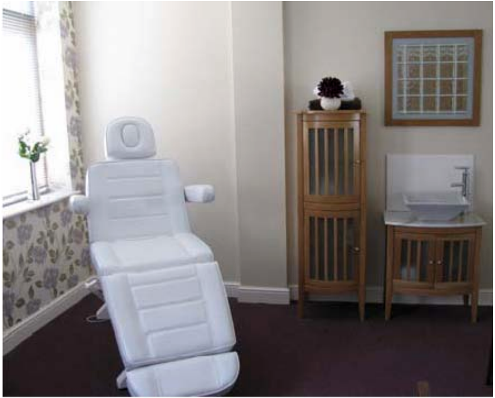
Pamper Room at Bramble Court, South Shields - Hanover

At least a therapy chair must be provided which easily converts from a treatment chair into a strong and stable couch allowing transition from a seated to a lying position. Such an item would usually provide an electronic lift and power-assisted section. Information outlined earlier should be considered to enhance the 'spa appearance and experience' of this room