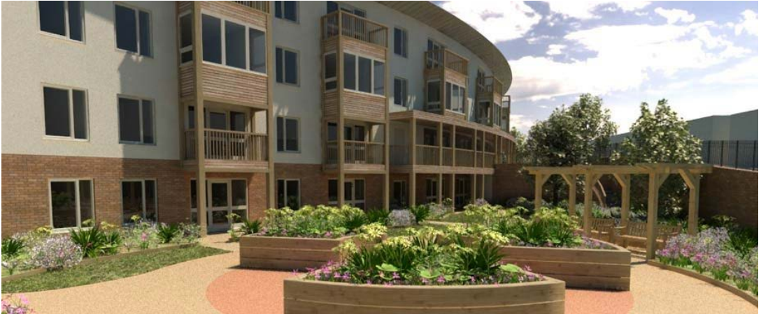
Clear circulation routes and seating areas with raised flower beds – Ravensfield, Dukinfield