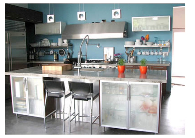
Open plan kitchen idea with glazed units and seating bar

Open shelving is an alternative used in many kitchens. These can be fitted with rails and blunt-ended hooks to hang utensils. A fridge with a glass door entices the person with dementia to eat what is in there. This open, visible approach also makes it easier for care staff to glance in the kitchen and get an idea whether the person is eating well.<sup>10</sup>