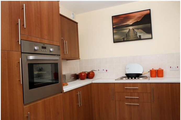
Kitchen with accessible oven and hob with front controls

Integrated cookers and hobs are usually provided as part of the fit out of the kitchen areas. The cookers should provide an easy opening door. Side opening oven doors can help people to access the oven and its contents easily, putting cooked food straight onto the bench areas. Bottom hinged oven doors create an immediate barrier into the oven as people need to stretch over it and into the oven for their food.