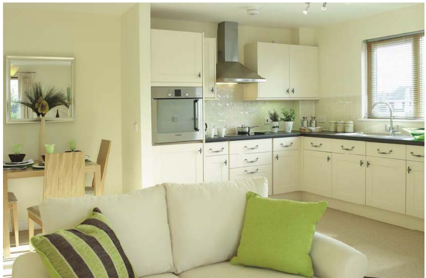
Example living area at Barton Mews, Staffordshire

Every design for new supported accommodation must focus on the quality of the spaces created, establishing the sense that this is a pleasurable place to live in, which will adapt to, rather than constrain the changing needs of a household. The HAPPI report outlines the open plan approach to older persons living – this approach can support an apartment to be flexible and 'care ready' utilising the provision of sliding doors and removing barriers within the apartment space. However, building regulations need to be carefully considered and the implementation of sprinkler systems may be required depending upon the open plan arrangements.