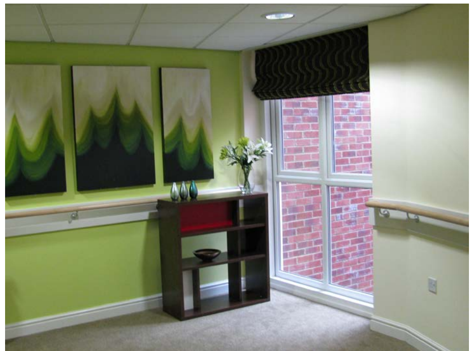
Example of way finding / identifiable zones at Bramble Hollow, Hetton le Hole