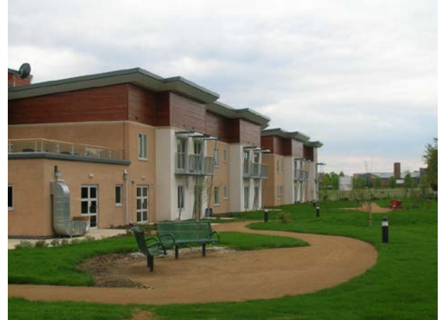
Llys Eleanor Extra Care – Flintshire County Council

Llys Eleanor Extra Care Scheme has a wealth of state of the art features including 'intelligent' sprinkler system and telecare/assistive technology to aid daily living. Environmental features include rain water harvesting linked to wc facilities and allotments in pleasant extensive grounds.