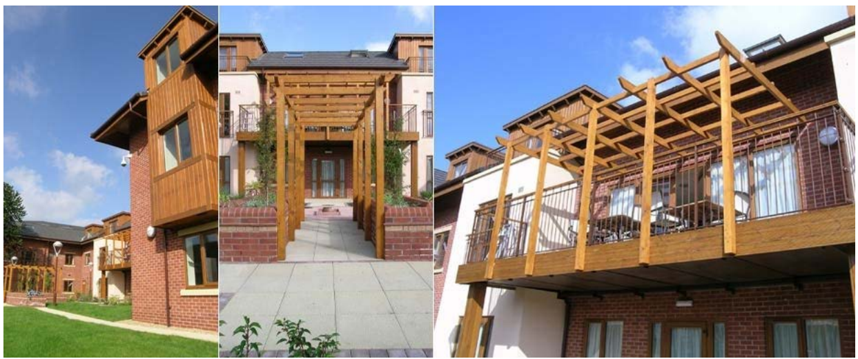
External appearance providing useable and accessible places - Millhouse, Nantwich

A fundamental principle in any building design is that the design should compensate for impairments. Impairment becomes a disability only when the built environment does not compensate for impairments, which could include:-