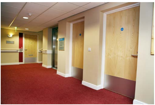
Lift in main entrance – Beckwith Mews, Silksworth – Housing 21

Lifts should be located adjacent to central facilities and have a clear 'waiting' space in front of them. If the lifts are intended to be used for evacuation they will require a lobby, ideally with hold open devices.