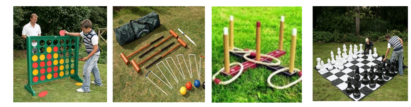
Flexible games / activities