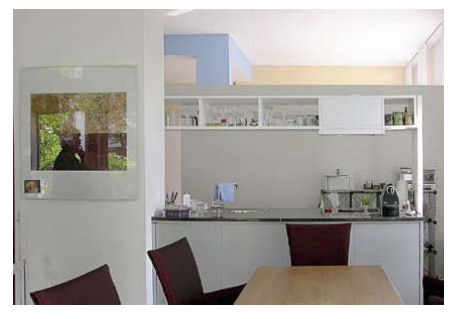
Flexible open plan kitchen and dining area - Solinsieme – St Gallen,