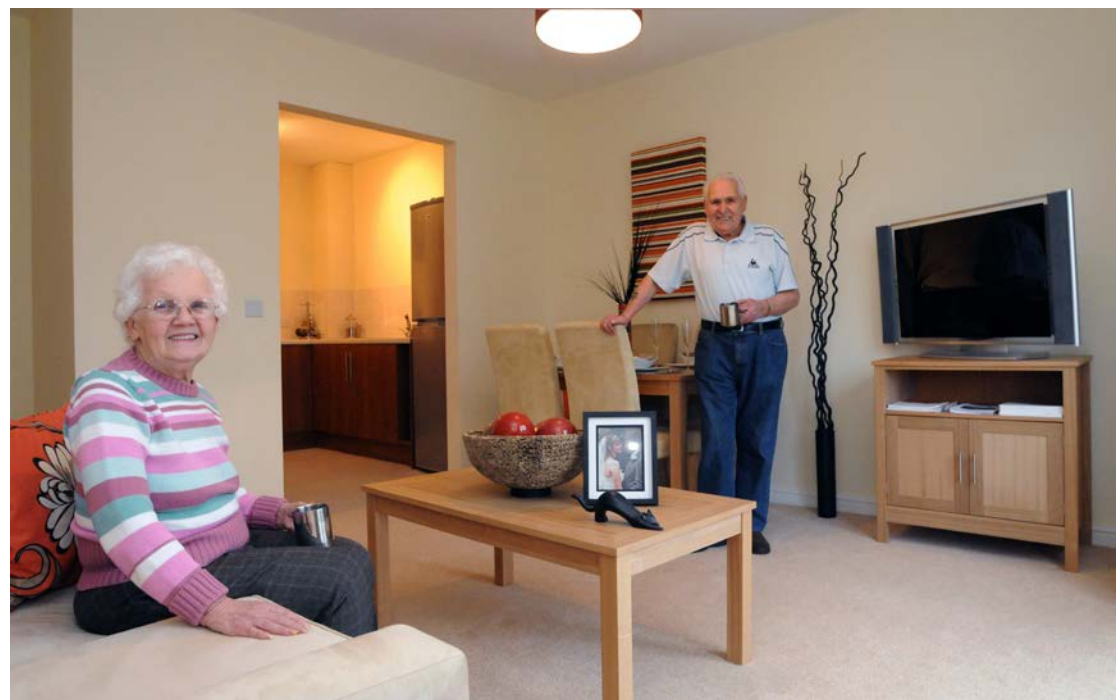
Sitting room with dining area at Woodridge Gardens, Washington – Housing 21