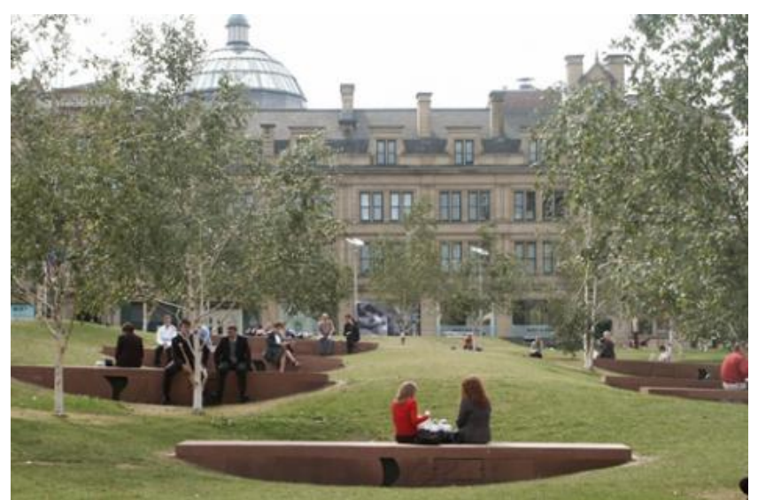
Example seating and environmental design

Seating areas should be designed to meet the requirements of all residents of all abilities, particularly wheelchair users and those using mobility aids. Seating should be located at all main entrances for those awaiting transport; or who want to sit and watch the world pass by. The design and location of seating at the entrance must consider the requirements for a minibus and taxi drop off undercover and to allow for the anticipated size and tracking of emergency and service vehicles, turning heads and waiting bay.