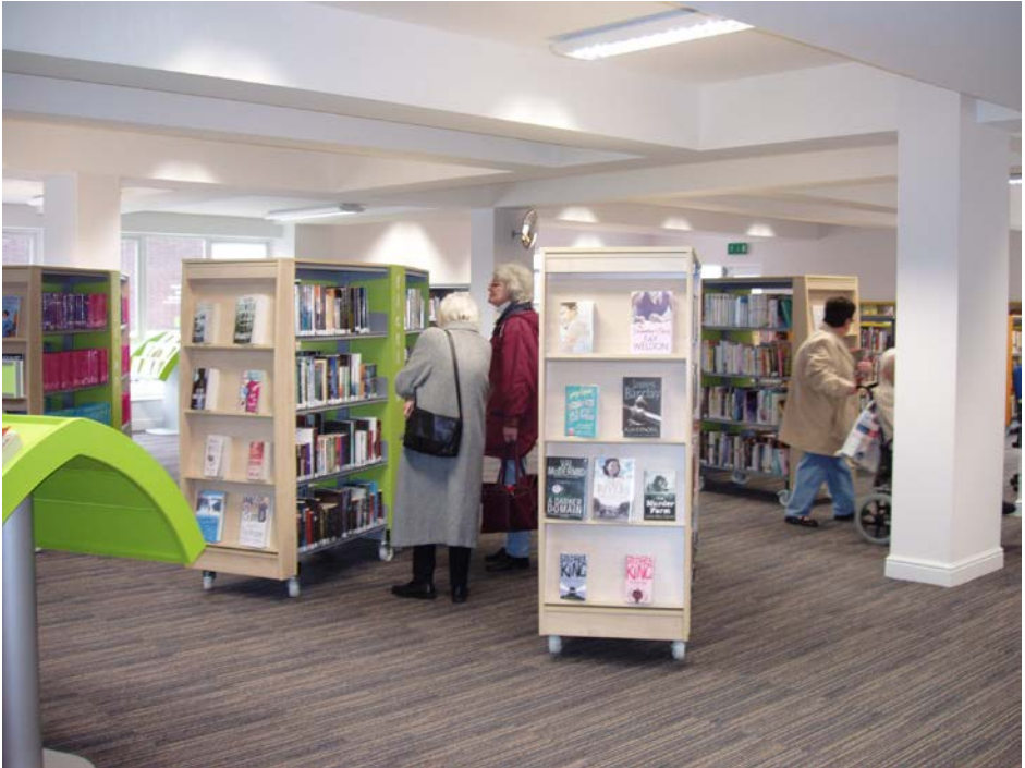
Silksworth Community Library at Beckwith Mews Extra Care Scheme

Embracing value for money principles and being efficient in some areas may enable additional resources to be invested elsewhere.