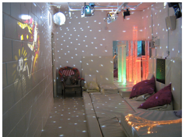
White room :- www.worcestersnoezelen.org.uk

The room in the image above has elements which can be operated by the user from any position in the room through a series of simple switches which provides complete control over the individual's environment.