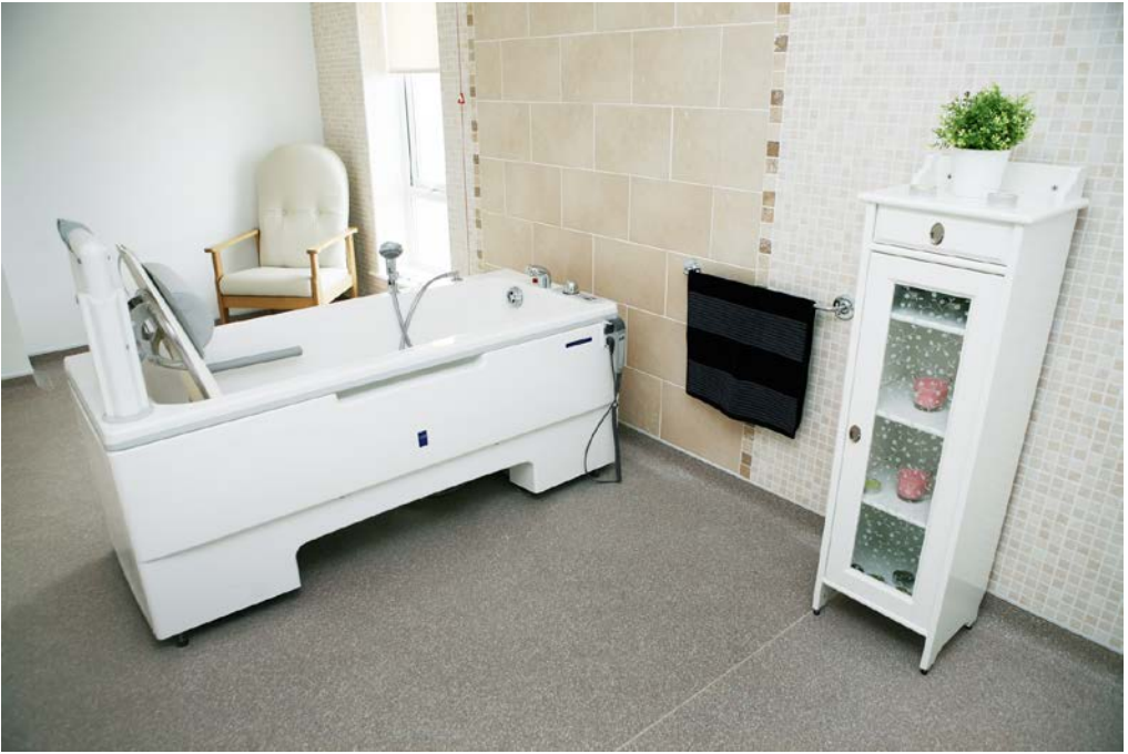
Assisted bathing suite – Beckwith Mews, Sunderland – Housing 21

The bathing and healthy living suites should be decorated in such a way to promote a 'spa' appearance rather than a clinical appearance. The use of plants and domestic furnishing can give these areas a comfortable and relaxing feel alongside providing light dimming facility; atmospheric music; and aromatherapy being piped into the room. Consideration can be given to combining both provisions into one area to maximise the use of the space and keep service charges to a minimum. Providing a shower curtain and rail around the bath or a retractable screen can provide a more relaxing and informal bathing experience for the bather; or can screen off the bathing area when not in use, for those receiving treatments, if the room provides for both.