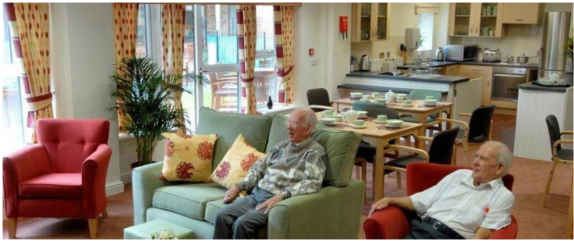
Design without barriers and requirements for signage, Belong, Macclesfield

Many people with dementia like to walk a lot. Design should provide natural and seamless access from inside to outside areas and vice versa, taking into account weather issues, and at the same time allow unobtrusive observation by staff and families. Limit the numbers of doors in communal corridors and to communal rooms to encourage people to have 'free walking experience'. Integrating exercise equipment into internal and external spaces, can help to eradicate excessive energy, which suggests that the need to wander can be reduced and it can also help to increase appetite.