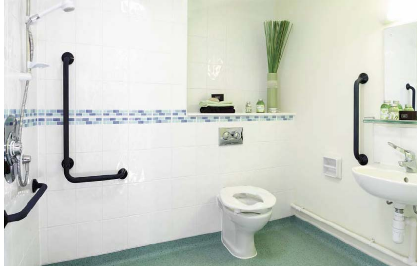
Example bathroom provision at Barton Mews, Staffordshire

In larger family bathrooms consideration must be given to:-