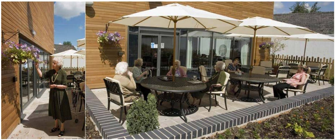
Outside eating area, providing al fresco dining - Belong, Wigan