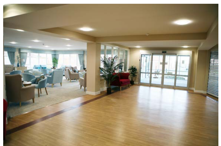
Entrance, main foyer and lounge with library access to the right – Beckwith Mews, Silksworth

Good lighting is important throughout the routes but higher light levels can be used to differentiate public from private areas.<sup>7</sup> Lighting in corridor areas should be programmed to dim during later evening hours, with PIR detection of movement which will cause the lighting to return to full power and gradually return to dim while corridors are unused. This will help to reduce electric usage and associated service charges for electric utility.