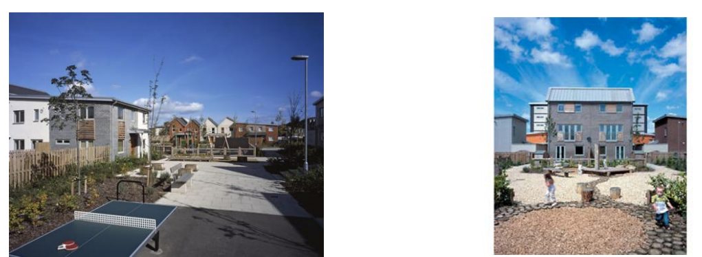
Outdoor table tennis and social space - The Staiths at Gateshead