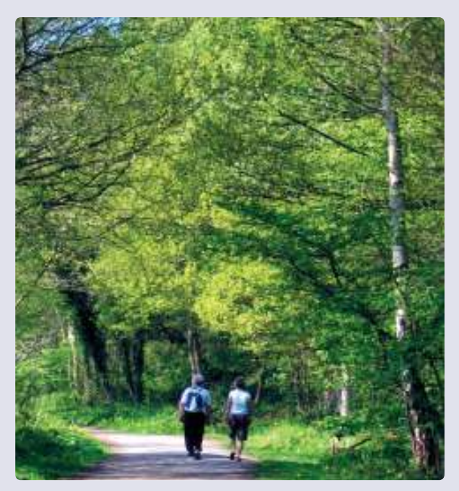
The Derwent Walk, Gateshead – conducting an HIA can be a practical way of encouraging planners and public health practitioners to work together

the option for them to require an HIA for major developments.