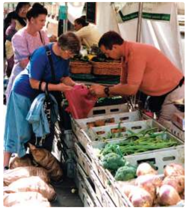
Bristol Farmers' Market – the planning system can help to improve access to healthy food and reduce obesity

In line with the Government's commitment to localism – where decisions are taken as closely as possible to