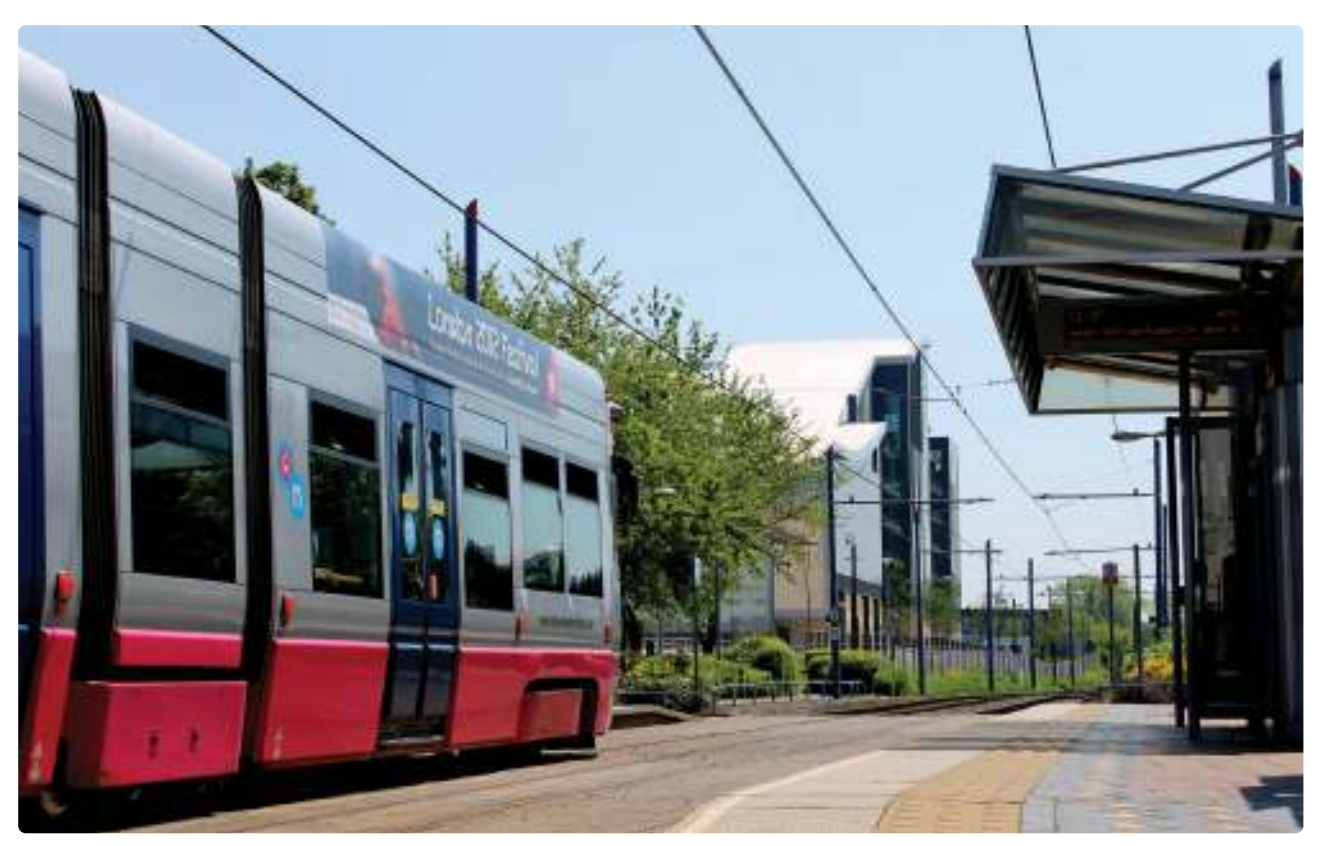
Midlands Metro and Sandwell College – the NPPF promotes sustainable transport and high-quality design, which can both improve health outcomes

3 Creating Garden Cities and Suburbs Today. TCPA, May 2012. http://www.tcpa.org.uk/data/files/Creating_Garden_Cities_and_Suburbs_Today.pdf