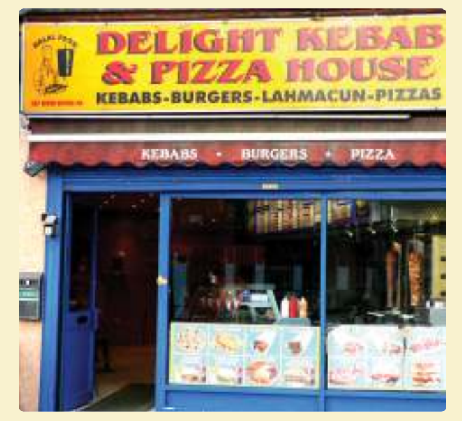
A fast-food outlet – in some places, for example Birmingham, planners and public health specialists have collaborated to produce guidance on restricting hot-food takeaways

While there is no need to abandon Excel completely, supplementing data with maps, pictures and images can convey some aspects of what healthy places look like, and could perhaps help to inspire people who find data intimidating or difficult to interpret.