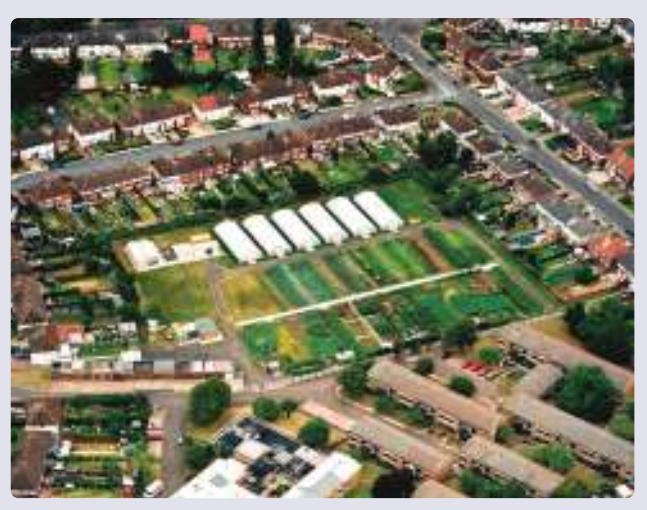
Three Acre Market Garden, Sandwell – Sandwell's Black Country core strategy considers access to fresh food when assessing housing proposals

The authors have also selected a list of examples of recent and forthcoming local plans (also called core strategies) that include health-specific policies. This is available as an online resource on the TCPA website, at http://www.tcpa.org.uk.