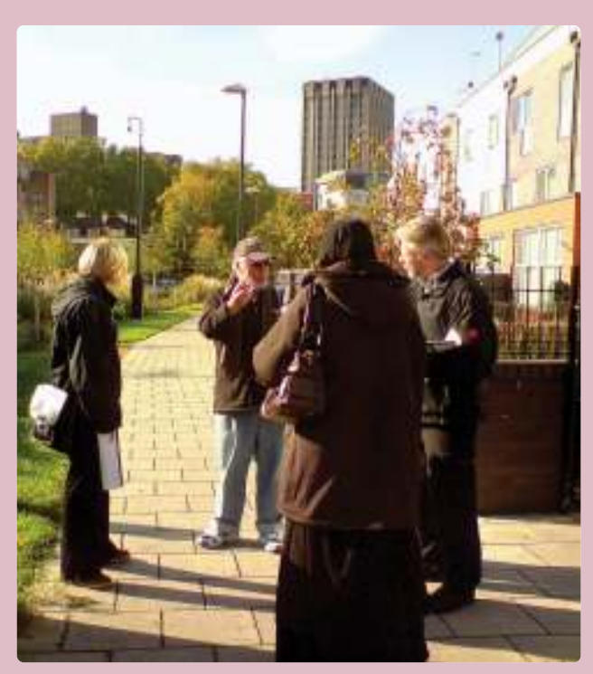
St Jude's healthy neighbourhood walkabout, Bristol – NHS Bristol's healthy neighbourhood checks involve residents in identifying opportunities to improve health locally

In Bristol , community health workers have worked with strategic policy-makers on a series of healthy neighbourhood checks. These explore with the local community those factors in their built environment that support health and those that limit choices for a healthier lifestyle – and identify opportunities for associated actions. They consist of a half-day walkabout with local residents, workers and