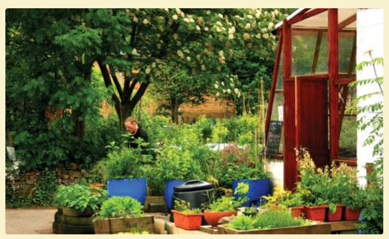
Windmill Hill City Farm Allotments, Bristol - local plans can help to secure access to green and food-growing spaces