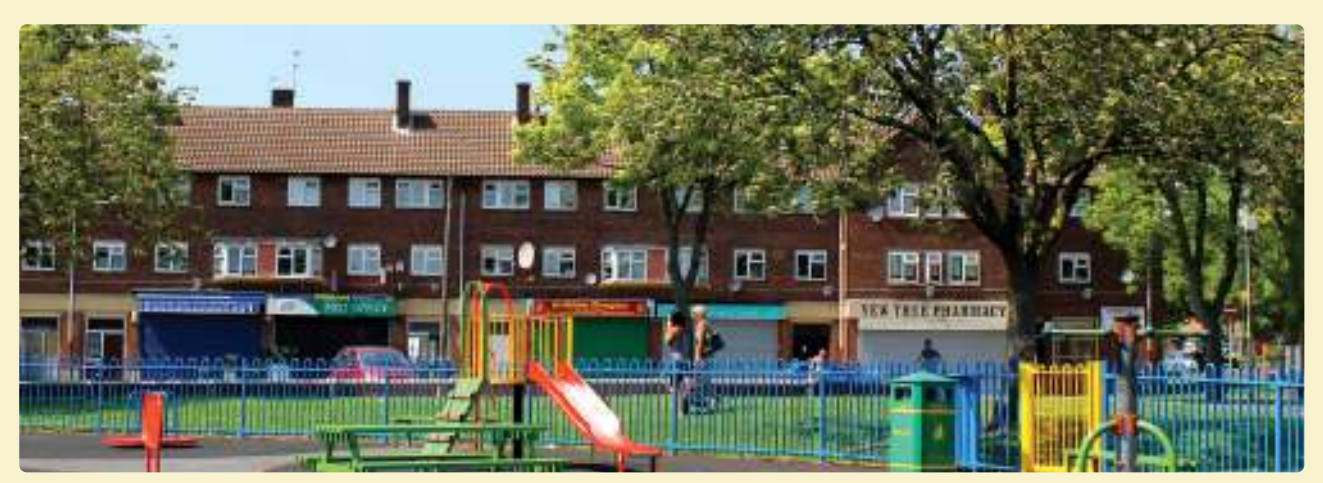
Local centre in Sandwell - planning and public health can bring a cross-cutting focus to issues such as access to healthy food

To improve co-ordination and raise the profile of the food agenda, a cross-departmental Food Interests Group was set up in Bristol , including health representatives. Planning issues that have come up include land for food growing, markets, hot-food takeaways, access to food, retailing, and protecting local centres. It has led to the Who Feeds Bristol report and the setting up of the Bristol Food Policy Council.