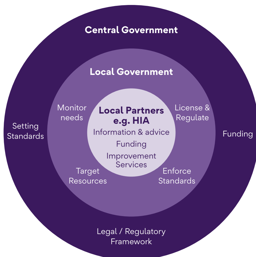
Figure 1: The framework for housing improvement

Central government has provided a legal and financial framework for housing improvement. Local government and NHS partners have delivered housing improvements, guided by this framework and working in partnership with other local organisations, such as Home Improvement Agencies (HIAs).