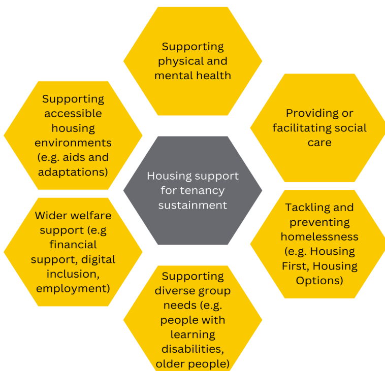
Figure 1: Housing Support Package

In the range of evidence available, positive outcomes related to Housing Support activity are often reported. The volume of qualitative evidence offered is much stronger than cost/benefit and economic impact data (as is discussed in the next main section). Looking at the grouping of activity, we can see the types of activity listed above support a range of activities across health, social care, welfare, homelessness, and supporting needs around disability and ageing (see figure 1). Given this diversity, the wide-ranging areas of Housing Support can include: