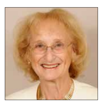
Baroness Greengross of Notting Hill

For many people, later life is far less healthy and happy than it ought to be. I have seen, first hand, the power of design to imagine and deliver better solutions for health and wellbeing. Design for Care is a much-needed programme and I am delighted to support it."