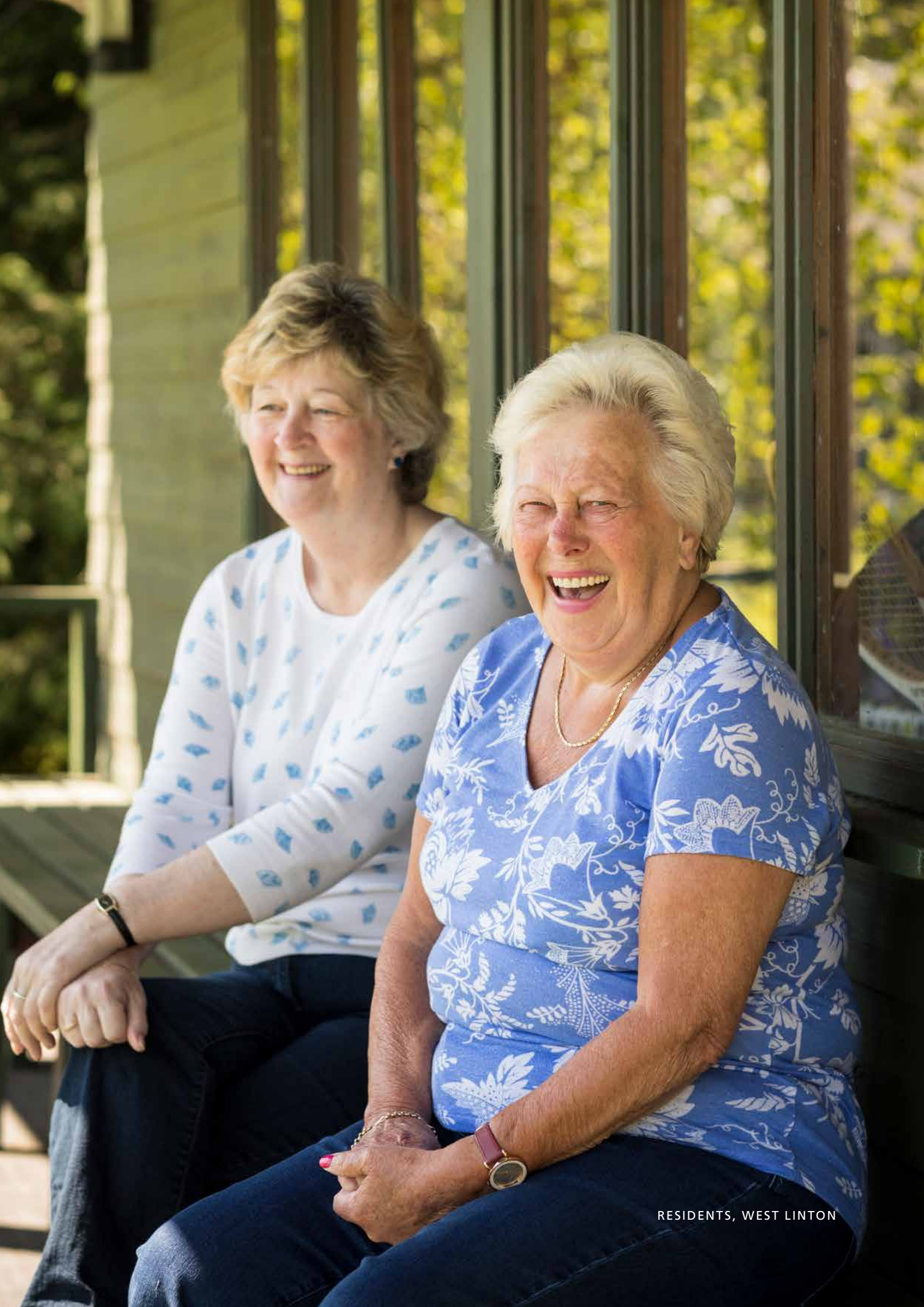
RESIDENTS, WEST LINTON