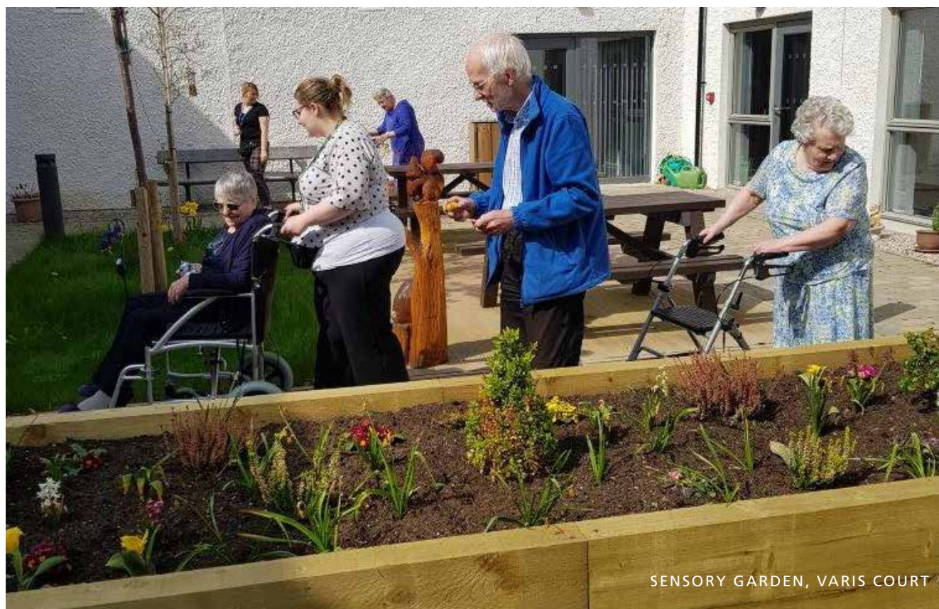
SENSORY GARDEN, VARIS COURT

The cinema offers reminiscence opportunities in a dementia friendly setting.