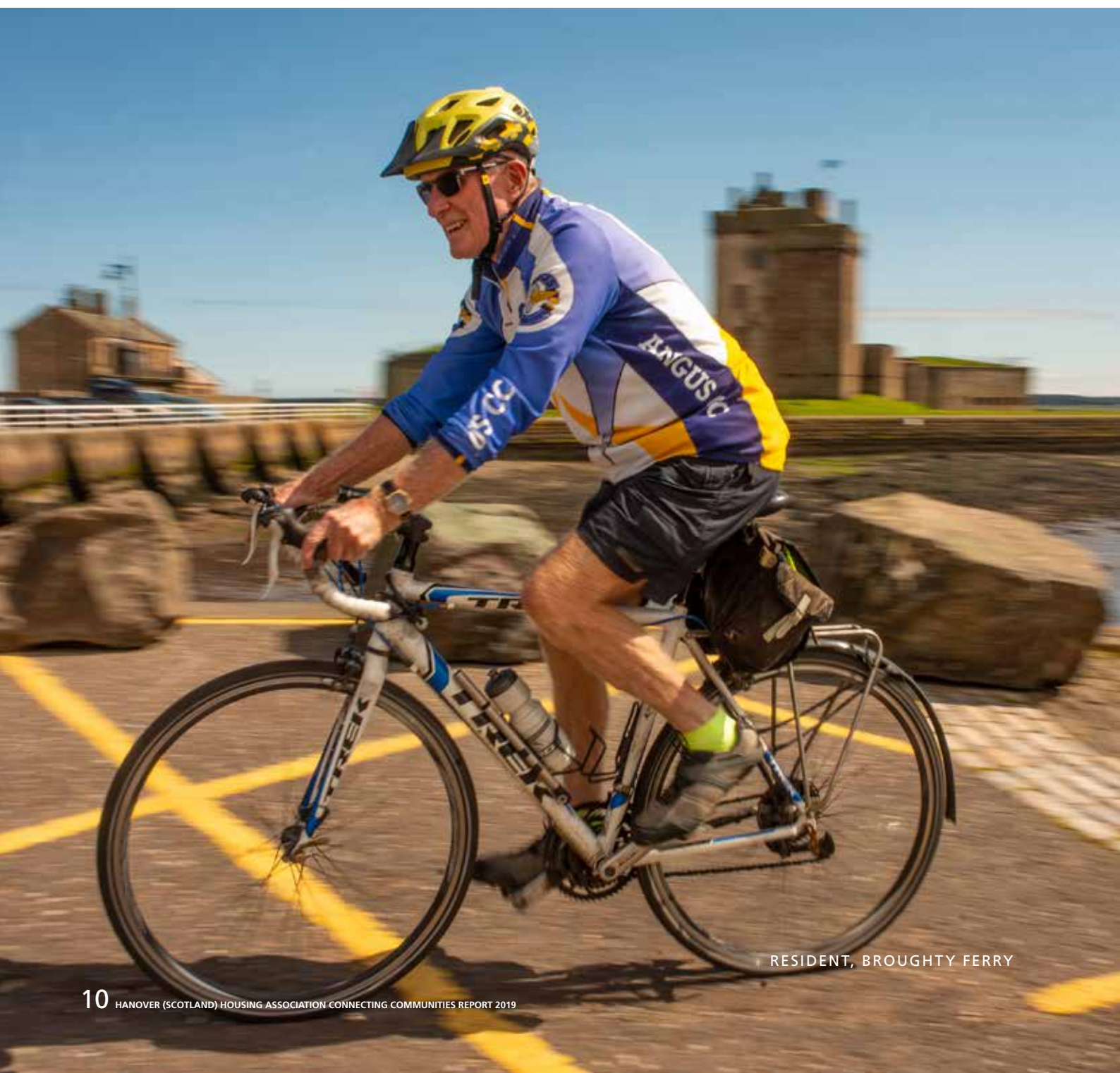
RESIDENT, BROUGHTY FERRY

We have drawn on the rich learning from the evaluation of Compassionate Inverclyde 14 . This report illustrates the value of kindness in tackling loneliness and social isolation, fostering belonging, and nurturing a sense of meaning and purpose in the lives of local people. Our Connecting Community project points to similar benefits that can be realised from supporting our staff to listen to what matters to residents and identify, nurture and value kindness that exists in our staff, residents, and local communities. Working in this way helped us understand the steps we can take as an organisation to improve well-being and to play our part in bringing to life a range of public policies.