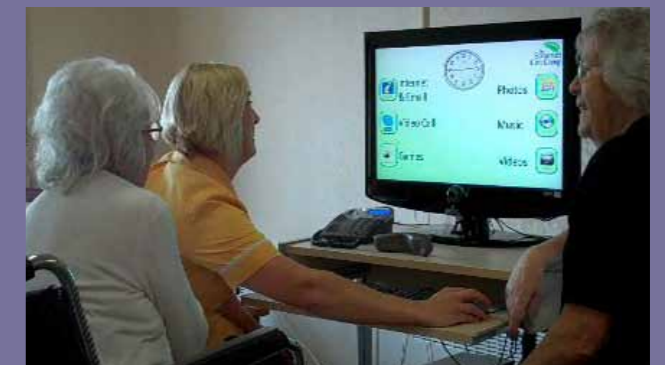
Digital communications and computers are part of the assistive technology family and help maintain family networks