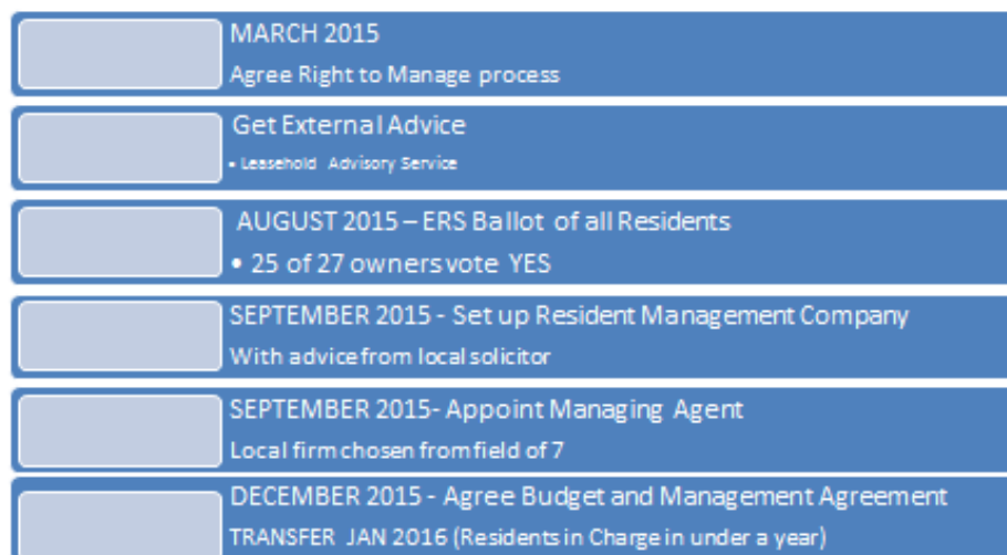
Figure 1: Co-producing the Change

The research found that in order to enable the change, three factors were needed: